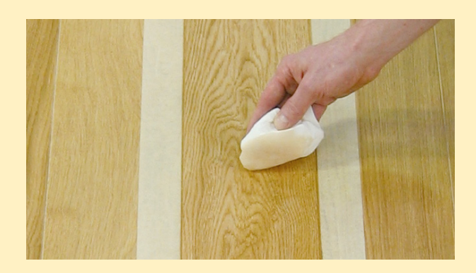
After drying, apply the 2nd coat very thinly with a lint-free cloth.