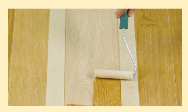
Apply Osmo Polyx®-Oil with the Microfibre Roller thinly.