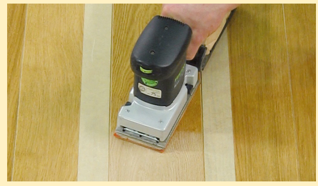
Sand the damaged surface thoroughly.