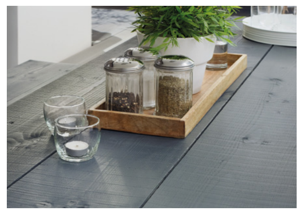
With the right colour, a plain wooden table becomes a showpiece.