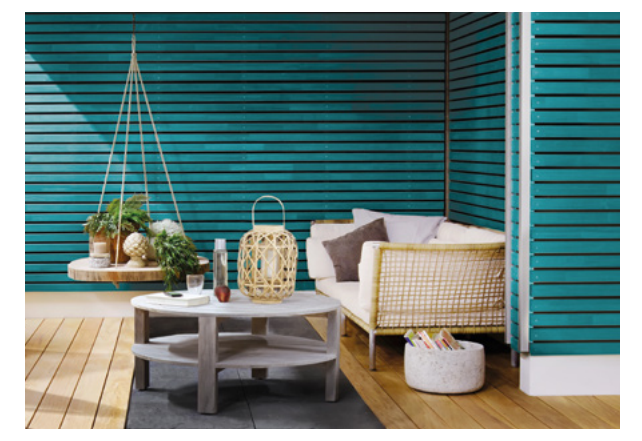
Set the tone for a cosy corner in the garden.