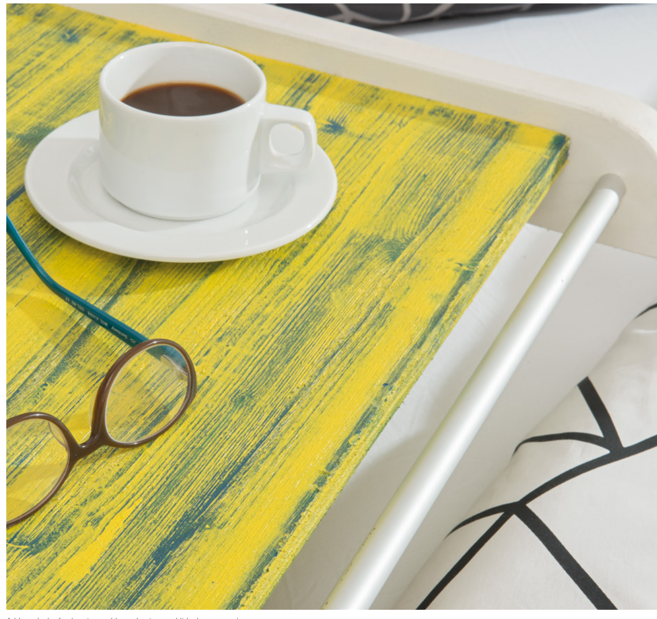
Add a splash of colour to an old wooden tray and it looks new again.