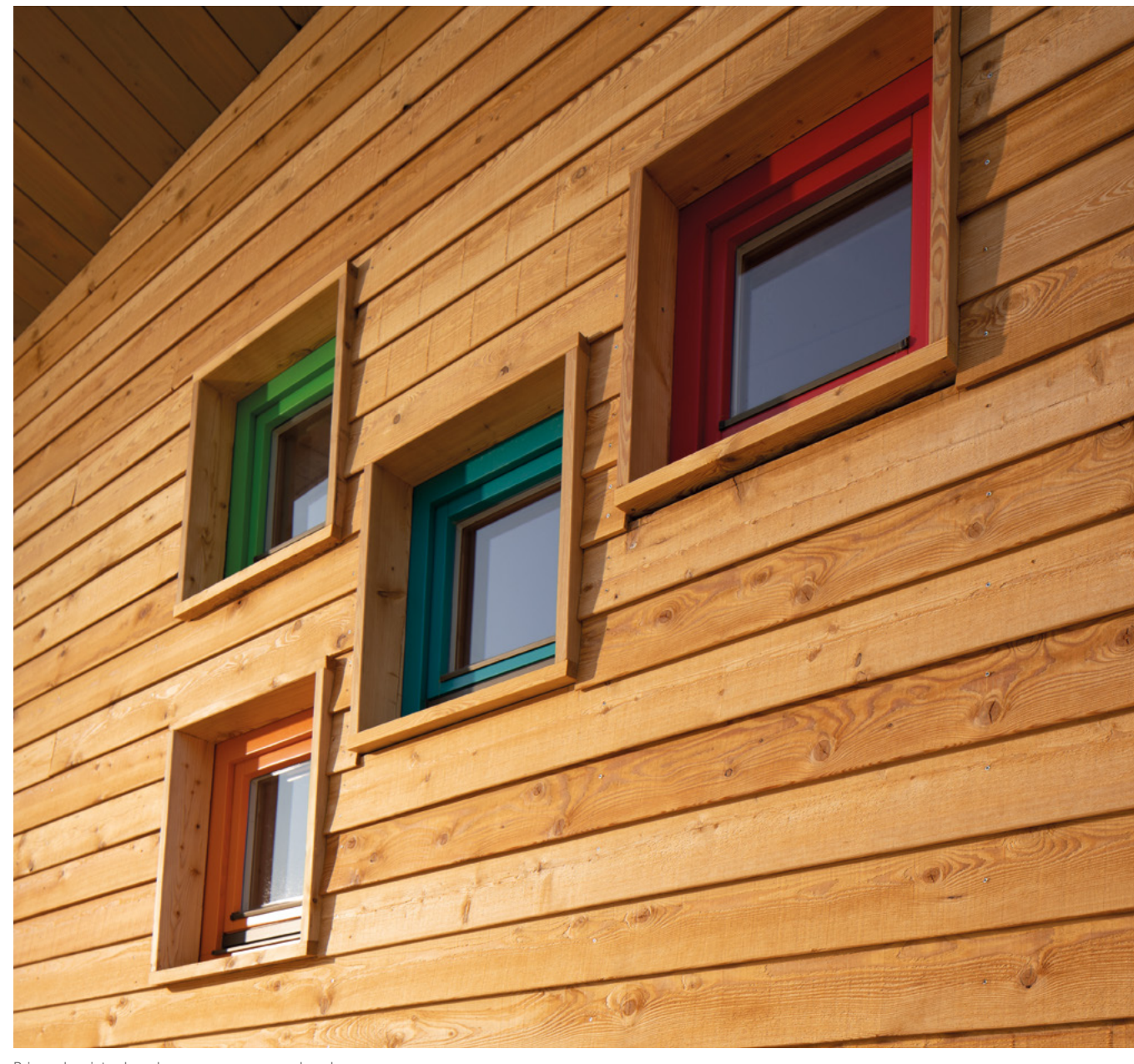
Bring colour into play – leave your own personal mark.