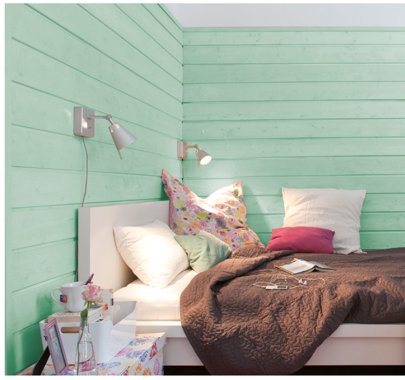
How about an unusual colour for your bedroom?