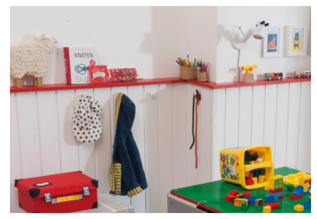
Colour brings life into every room.