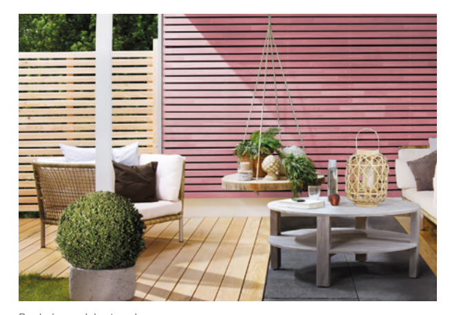
Be daring: celebrate colour.